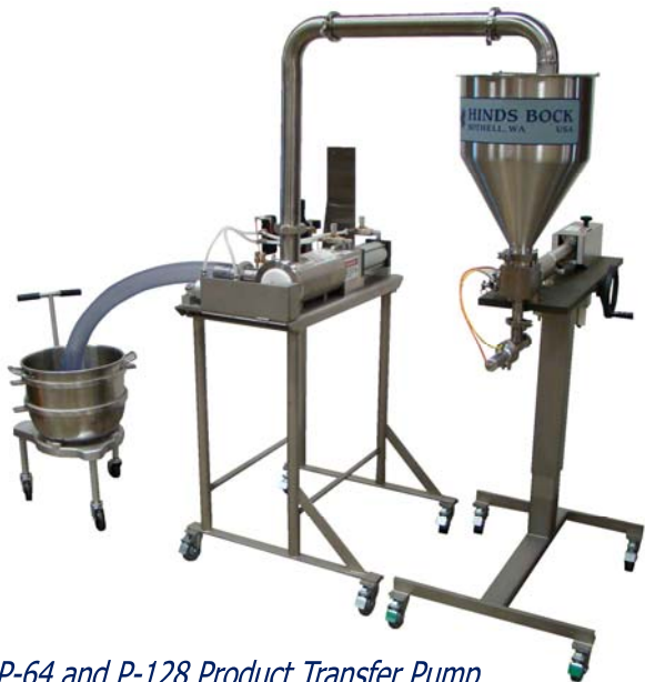
SP-64 and P-128 Product Transfer Pump The Classic Workhorse Duo!

Options Include: Conical (10-20 gallon) hoppers, "U"-shaped agitated hopper, change cylinders, a variety of spouting, automatic & semi-automatic controls, level probes, agitators... all matched to customers' applications